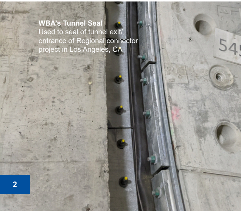
WBA's Tunnel Seal Used to seal of tunnel exit/ entrance of Regional connector project in Los Angeles, CA

Watson Bowman Acme is 100% focused on expansion joints, sealing and water-protectant technologies