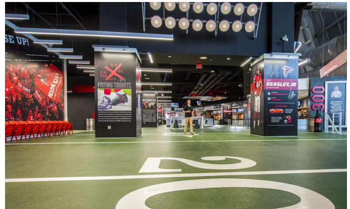
This section of the concourse is dubbed the "100 Yards Club"

To cap it all off, WBA provided a customized Wabo®Evazote—a low-density joint seal—to cover the stadium's expansive floor surface with an added layer of security.