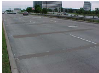
Figure 2: Renovated Roadway