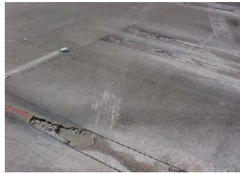
Figure 1: Crack and Spall